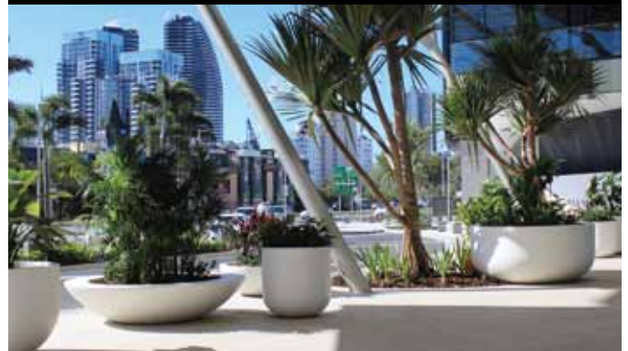
Figure 1: at the Pacific Fair Shopping Centre in Gold Coast, Australia, glass-fibre reinforced concrete (GRC) bowl planters were made, using Aalborg White cement

Although not new by any means, colour is a critical quality control issue where brightness and tone consistency are of paramount importance. The whiteness of Aalborg White cement depends on the raw materials used and the manufacturing process. Metal oxides, such as iron and manganese, influence both of these parameters, making it imperative to select raw materials of the highest-possible standard. Colour also offers additional sustainability and safety features. Light or white coloured surfaces reflect sunlight more efficiently than dark ones. White concrete median barrier's reflectivity is almost 50 per cent higher than grey in wet weather. Furthermore, at night, white concrete median barriers enhance visibility compared to grey concrete, greatly improving driving safety when used on highways.