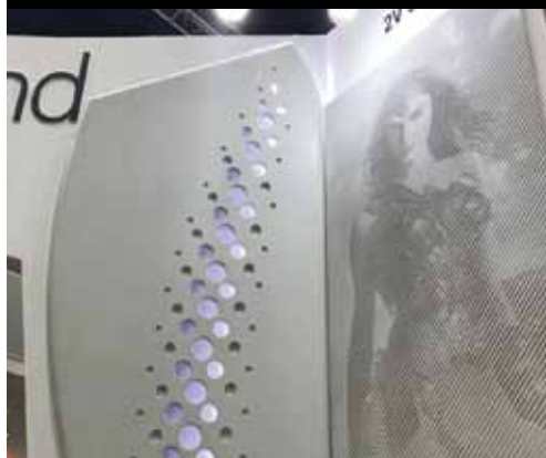
Figure 4: 3D engraving technology can be applied to ultra high-performance concrete (UHPC) cladding with impressive results

precast concrete producers, developed a series of impressive white cement-based UHPC cladding and GRC furniture and architectural elements. The richly-textured UHPC panels with smooth finishes were achieved using silicone moulds, while 3D concrete engraving technology applied on the cladding demonstrated the versatile possibilities on a concrete surface (see Figure 4). Gold-coloured GRC circular cone pillars with GRC round bench seating in terrazzo finishes demonstrate the concrete's decorative abilities both internally or externally. ■