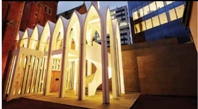
Figure 3: the design of the Cadogan Song School in Perth, Australia, was inspired by cathedral lancet windows with a striking white precast concrete façade made using Aalborg White cement

Cathedral choirs, is a stunning two-storey, US$4.8m white concrete precast concrete structure (see Figure 3). The building was designed by Palassis Architects and awarded the 2017 WA State Award of Excellence; the Concrete Institute of Australia 2017 National Award of Excellence and the Concrete Institute of Australia Kevin Cavanagh Trophy for Excellence in Concrete, the highest award that can be given to a concrete project in Australia.